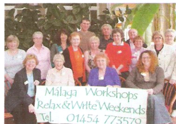
Writing Group at The Hayes