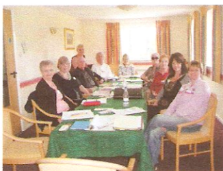
'Writing About Your Life' Swanwick