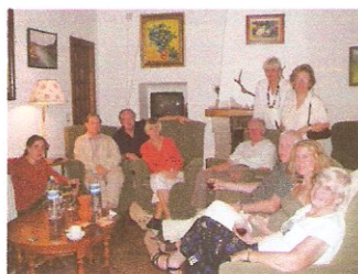
Writing in Grazalema Spain

Session 5: 3.00 – 3.45 p.m. Step 4 – Finding the best opportunities in your target publication. Practical exercise. Refreshments 3.45 p.m. Tea and Coffee Session 6: 4.30 – 5.30 p.m. Step 5 – Structuring your article. Techniques for different markets. Exercise: Drafting your article structure. Dinner 6.45 p.m. In the Dining Room. Session 7: 8.30 – 9.30 p.m. Step 6 – Article extras. Adding value to your work. Exercise: Creating Fact files & Boxouts. Meet in the Bar & Lounge: 9.30 p.m. Discussion or continue writing in the lounge or in your Room.